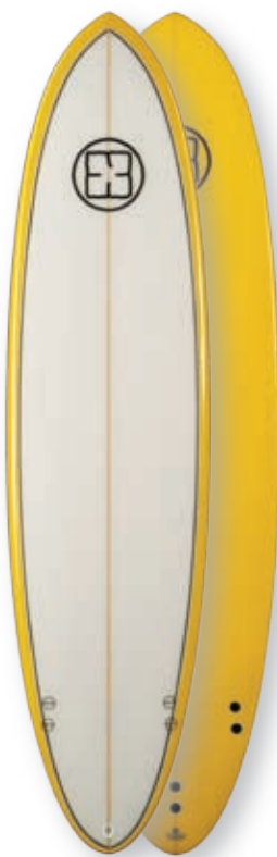
Rail and Bottom Spray Yellow