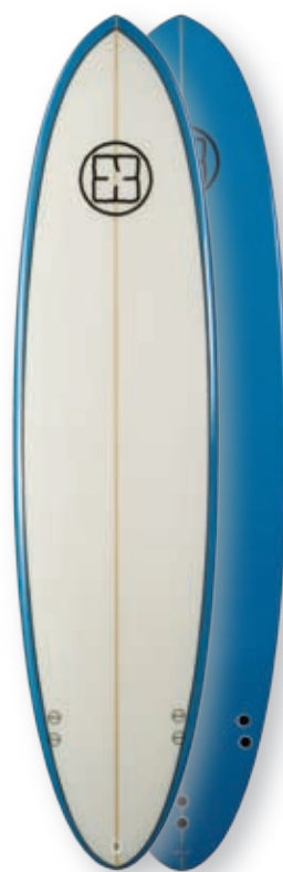
Rail and Bottom Spray Blue