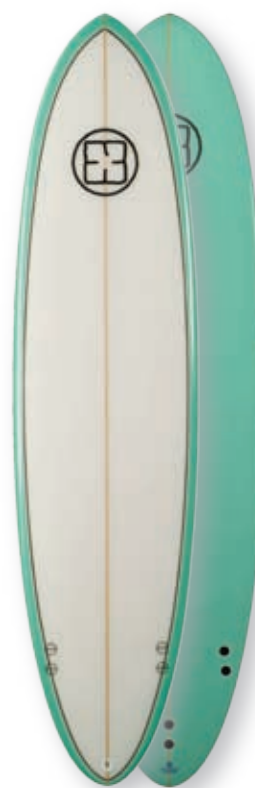
Rail and Bottom Spray Green