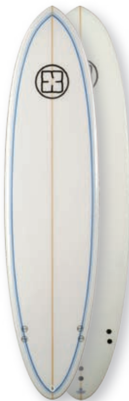
Double Blue Pirlines + Decals