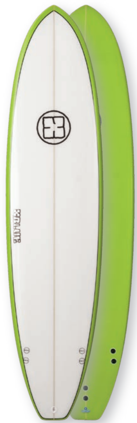
Rail and Bottom Spray Green