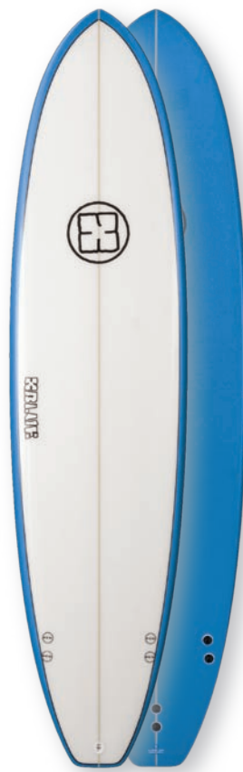
Rail and Bottom Spray Blue