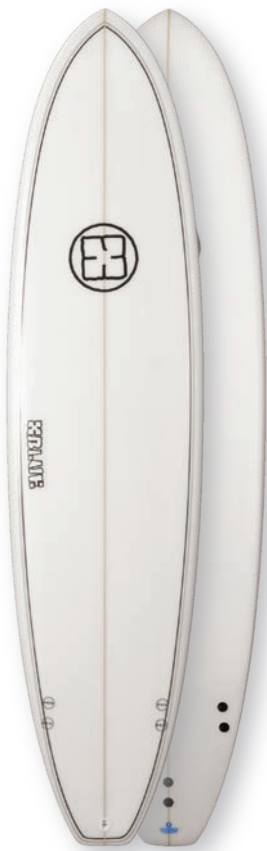
Double Blue Pinlines + Decals