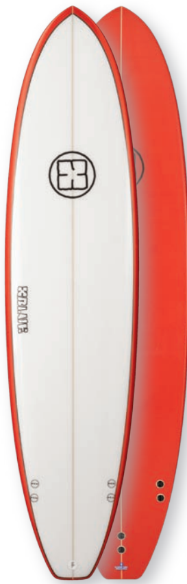
Rail and Bottom Spray Yellow